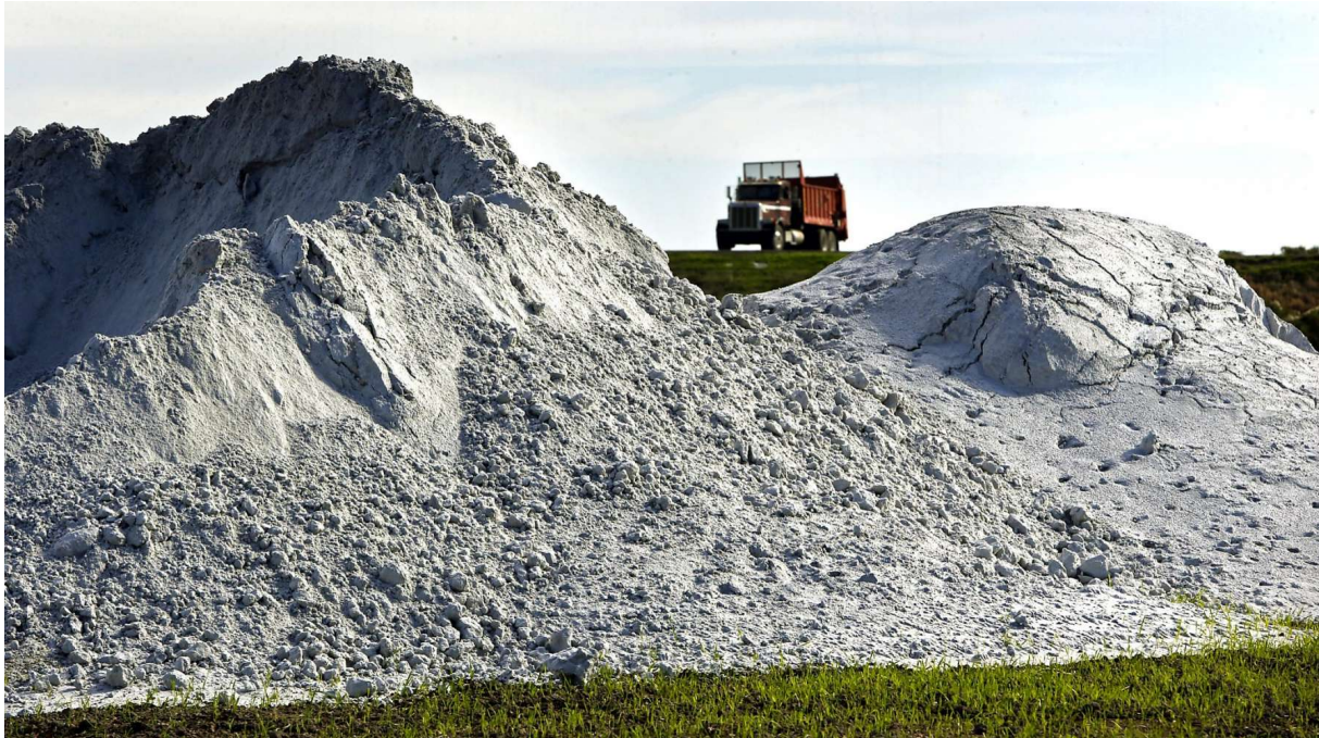
Lime waiting to be spread along a levee at the Sears Point Wetland Restoration, which began with fanfare in 2015 but could take 15 years or more.