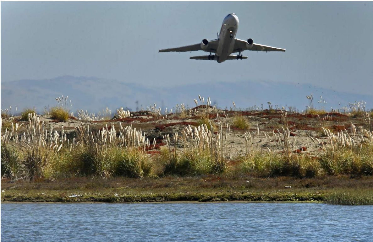
A jet takes off over the original levees that surround Oakland International Airport, which opened in 1962. With as little as 18 inches of sea level rise, water could spill across Doolittle Drive onto the airport runways several times a year during extra-high tides unless the drive’s low spots are raised.

This might sound frivolous, but it’s essential. No matter how grim the political climate in Washington, D.C., might be, the design community here and beyond can offer scientifically grounded visions of the future that stir a sense of potential rather than dwelling on apocalyptic what-ifs. A proposed competition would offer us the chance to move the discussion forward; the sooner that it begins the better off we all could be.