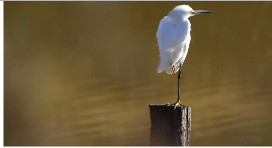
An egret rests at the Alviso Ponds restoration project where more than 2,200 acres of ponds have been connected to S.F. Bay in Alviso.

By starting now, the restored tidal marshes should be hardy enough that as sea level rises, the remade wetlands will endure.