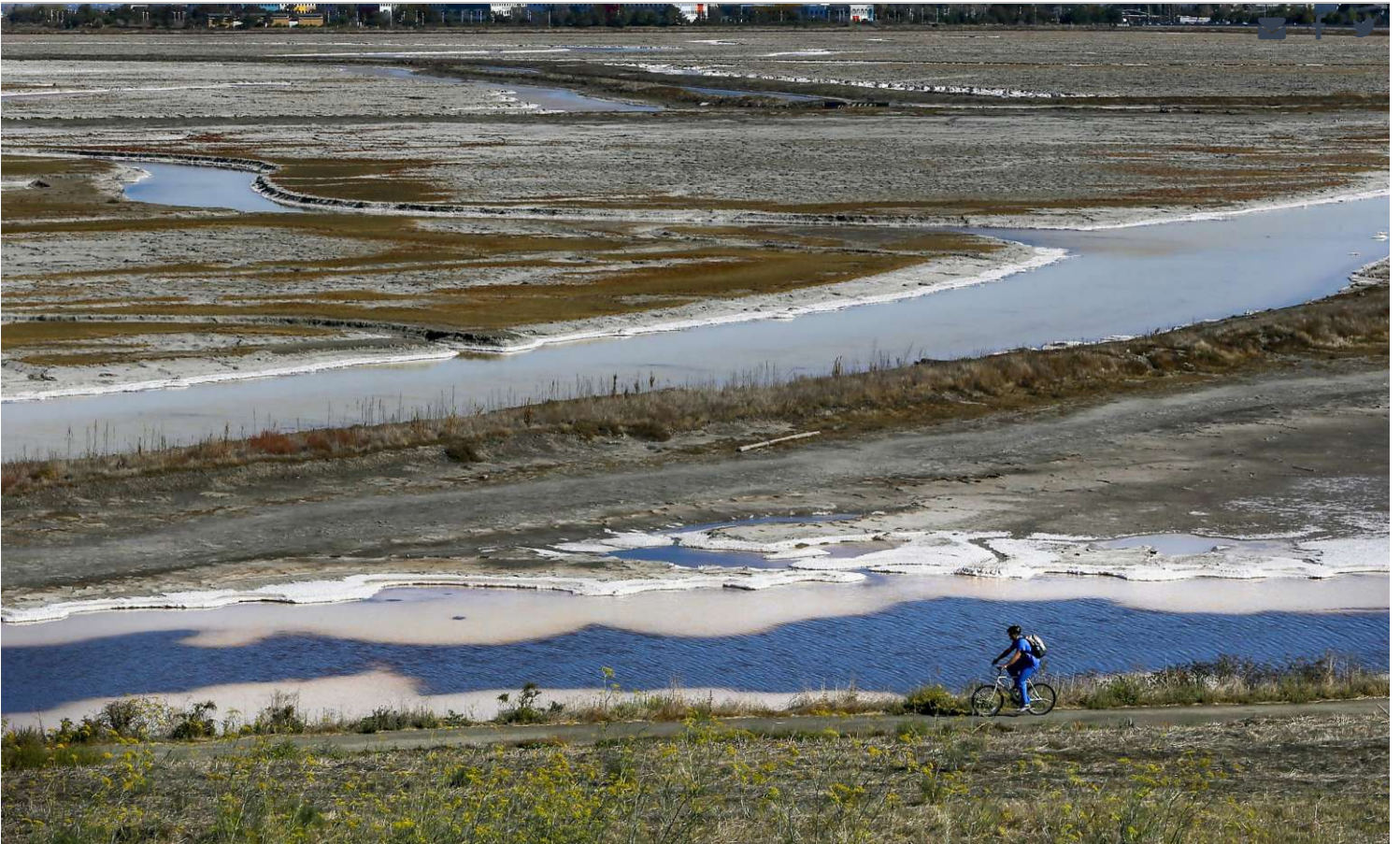
A view of the South Bay Salt Ponds restoration project at Bayfront Park in Menlo Park.

The regulatory dilemmas that hinder the Bay Area’s ability to prepare for sea level rise are confounding, whether it is the four years to secure the approvals and permits for the Ravenswood Ponds or the bureaucratic thicket along San Leandro Bay.