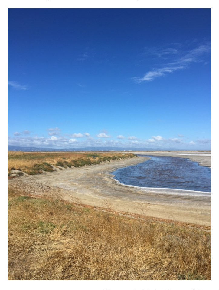
Figure 3.16-2. View of Pond E6C, Facing West

Figure 3.16-2 was taken from the southeastern corner of Pond E6C along the eastern boundary of the project and faces west northwest. There are no designated trails currently in this area of the Inland Ponds. As demonstrated in the image, views to the west of the Inland Ponds and Bay Ponds are distantly enclosed by the Santa Cruz Mountains located on the west side of the Bay on the peninsula. Views from the Inland Ponds toward the west and north are panoramic and unobstructed. Foreground to midground views are characterized by a mix of open water and upland berm areas that separate the Ponds. The upland areas associated with these berms draw the viewers eye as they create contrasting form, line, color, and texture with the dominant non-linear nature of the open water that occupies most views toward individual Ponds. Currently only the upland berm areas separating the ponds are vegetated, and therefore the sinuous to geometric form these berms follow appear course to smooth in texture with muted rounded to form dominated by natural shades of light to dark brown and pale greens which complement the typically bright blue nature of the open water within the salt ponds.