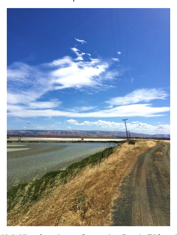
Figure 3.16-3. View from Levee Separating Ponds E5C and CP3C, Facing East

Figure 3.16-3 was taken along the southern boundary of Pond E5C facing east toward Hayward. The PG&E distribution line and remnant structures associated with salt production are among the few visible structural and vertical elements in existing views from this area. As discussed above, the East Bay Hills distantly enclose easterly views from the project, and add a sense of rounded topography that contrasts with the open space of the project area that occupies the fore to midground of most easterly views from within the project area. Natural shades of brown, pale green, and blue dominate the landscape. Vegetation is sparse, and limited to areas surrounding access roads and levees. Where present, the vegetation adds a medium to fine grained texture to the composition of views, which contrasts with the otherwise smooth and glassy nature of calm conditions within the ponds.