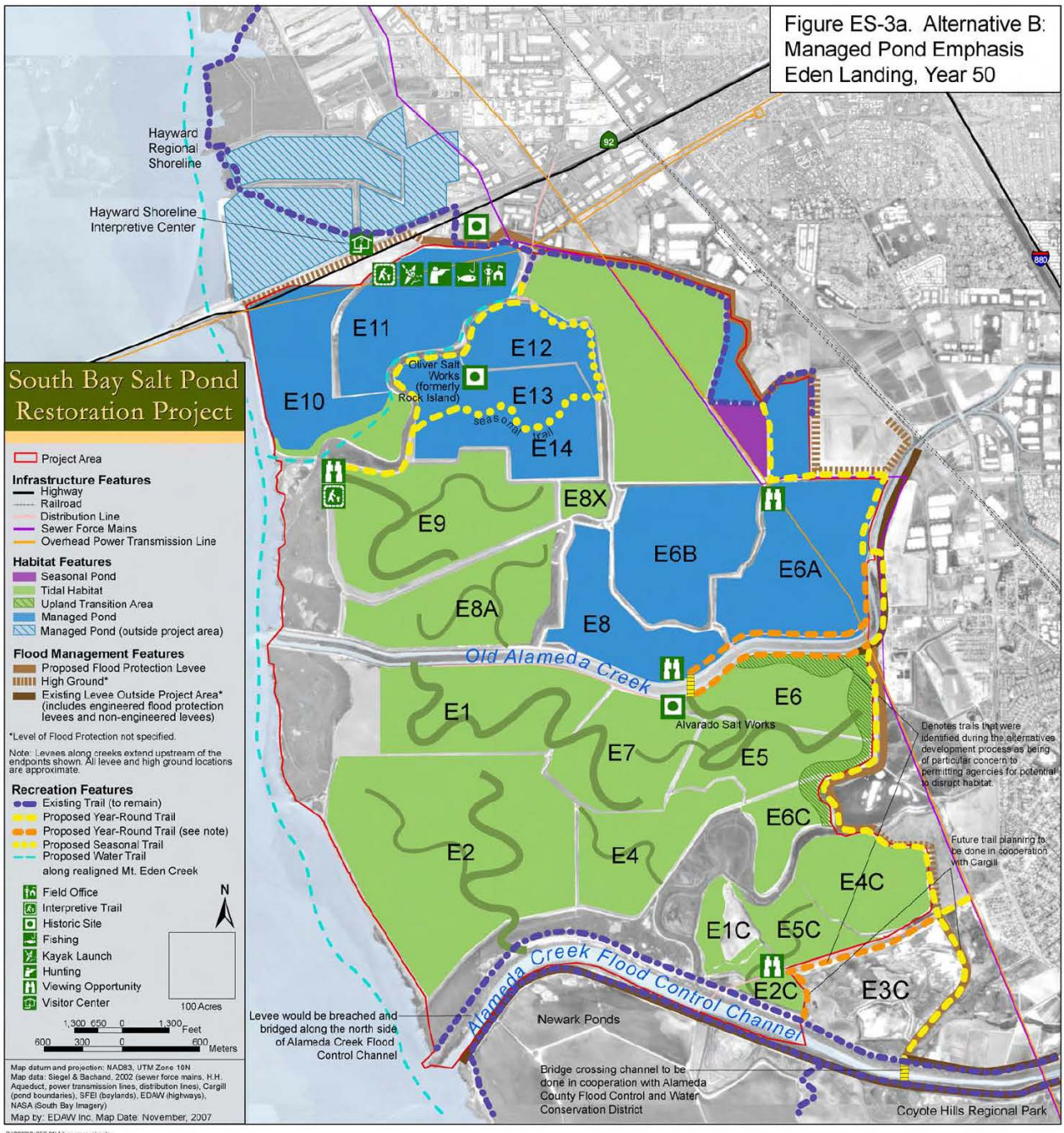
Figure ES-3a. Alternative B: Managed Pond Emphasis Eden Landing, Year 50