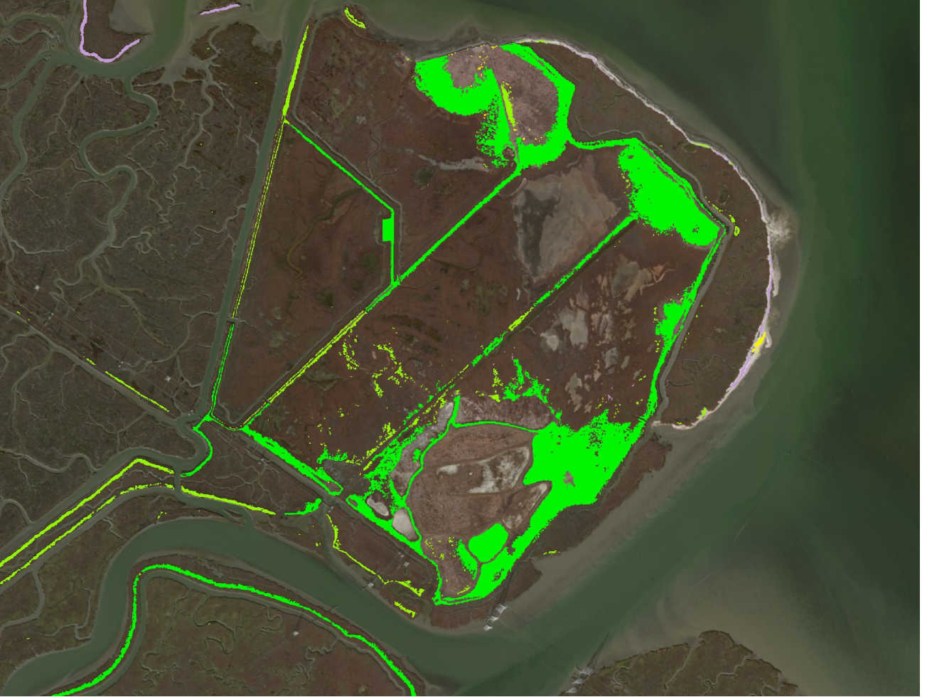
Final Index Value at Bair Island