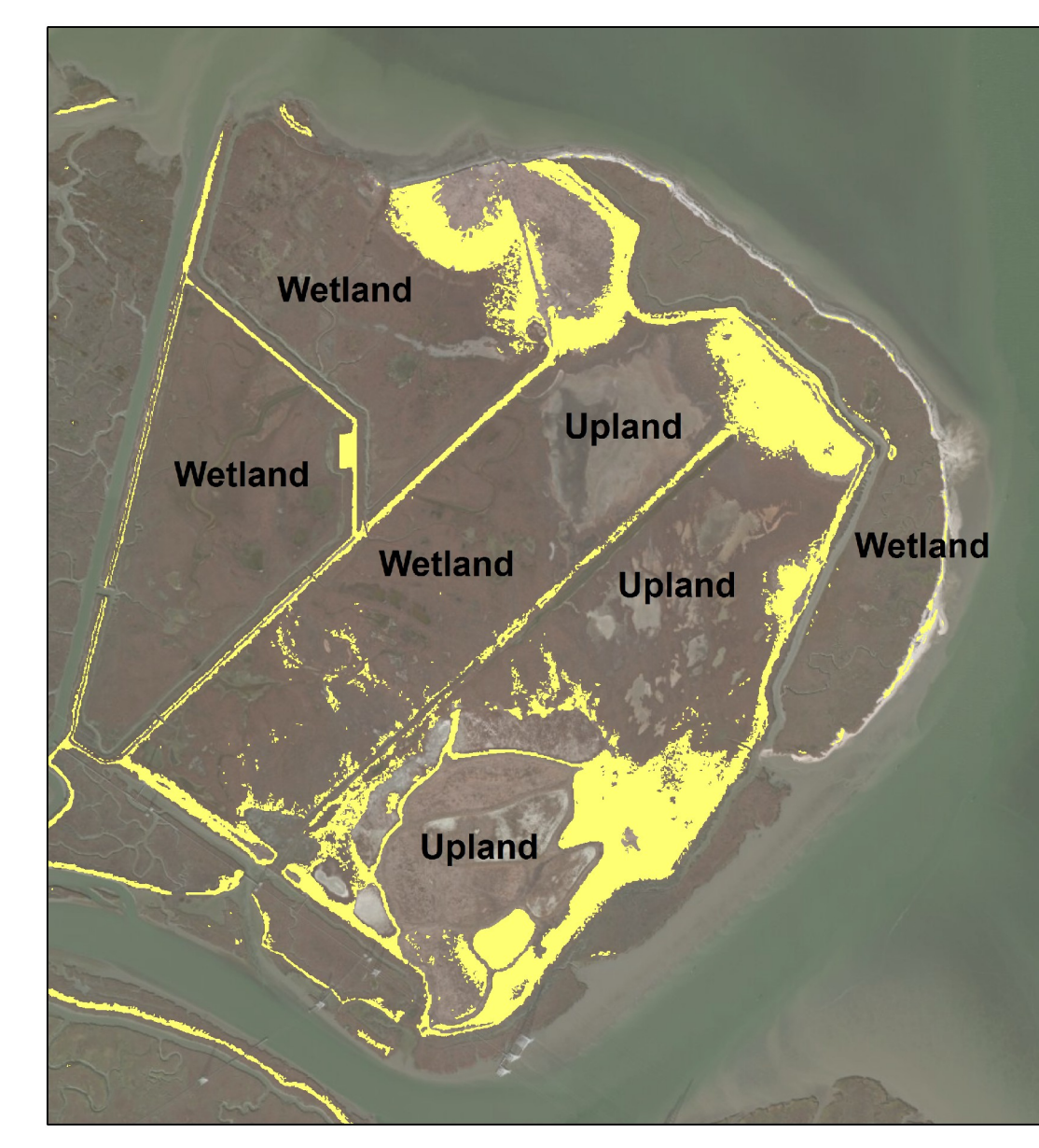
Adjacent Habitat at Bair Island

The focus on the DSS is to identify, map, and rank transitional zone patches between wetlands and uplands . Consequently, the (a) proportion of shared boundary for adjacent land cover(s); and (b) area (i.e. size) of these same adjacent land covers were quantified in ArcGIS for each transitional zone polygon "patch" mapped in Step 2. Land cover types included: tidal wetland, terrestrial wetland, urban, "upland", agriculture, forestland, and water. Transitional zone patches adjacent to both wetland and uplands were given the highest positive indicator values while patches adjacent to urban land cover were given negative indicator values. Indicator values for adjacent land cover assigned to transitional zone patches were weighted based on both the proportion (>= 50% of shared boundary given the highest weight) and area (50 acres of land cover given the highest value). We used land cover data from both the SFEI BAARI dataset (for wetlands) and the USDA's CalVeg dataset (for all other land cover types).