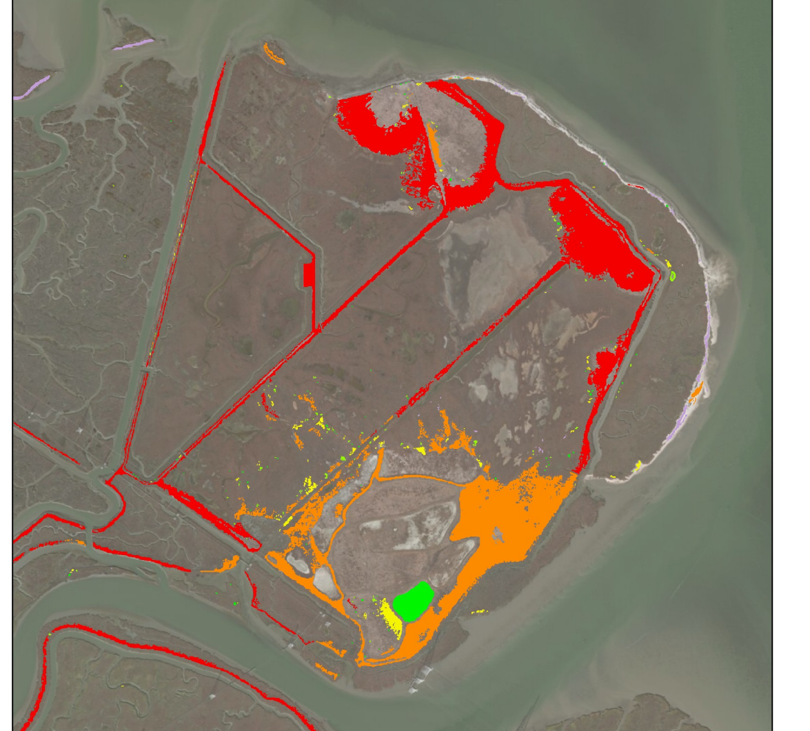
Shape Metric at Bair Island (red = liner, orange = mixed, green = compact)

A GIS based decision support system (DSS) to identify and prioritize marsh-upland ecotonal habitats (transitions) to assist land managers in restoring and protecting San Francisco Bay's (estuary) tidal marsh ecosystem will be presented. The DSS takes a strategic approach towards decision support, by accounting for the landward migration of high marsh and other transitional habitats in response to predicted sea level rise (SLR). Current documents do not adequately describe ecotonal habitats, quantify the amount needed to aid listed species recovery while allowing for SLR, nor prioritize specific sites for protection and restoration. The DSS combines definitions, GIS models of the distribution of TZH at the landscape level, site specific indicators for ranking patch "quality" for restoration or protection, and parcels level maps for prioritizing TZH throughout the SF estuary. This toolkit will help managers allocate limited resources on site prioritization, alternative/scenario evaluation, and will include considerations for the influence of future climate change and land-use scenarios. Although most indicators were mapped throughout SF bay, our pilot study focused on the south bay. Project findings will be made available on the web through an interactive mapping tool.